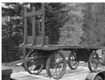
Great Northern Baggage cart circa 1910.