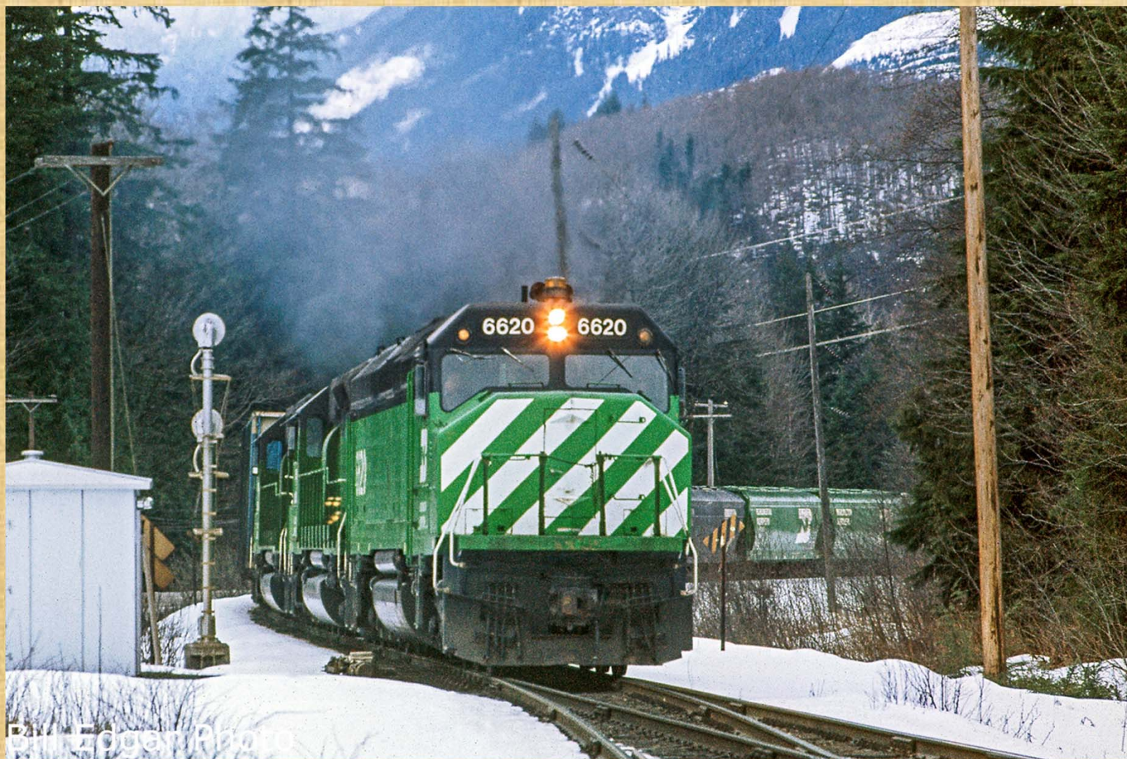
F45 BN 6620 BENDS THE CURVE AT BARING, WA FEB. 22, 1975 ON AN EB MANIFEST FREIGHT.