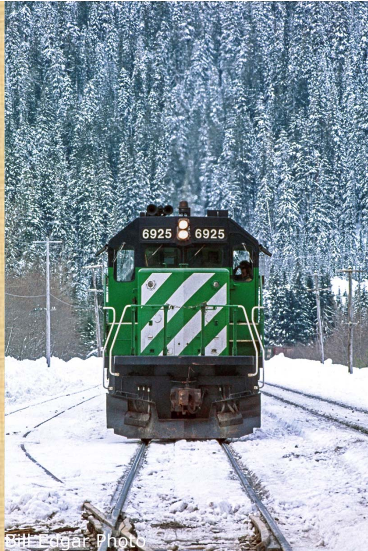
BN 6925, SD40-2 STOPS AT SCENIC TO WAIT FOR A WESTBOUND TRAIN TO EXIT THE CASCADE TUNNEL. FEB 22, 1975. IT WILL BORROW A UNIT FR. THE WB.