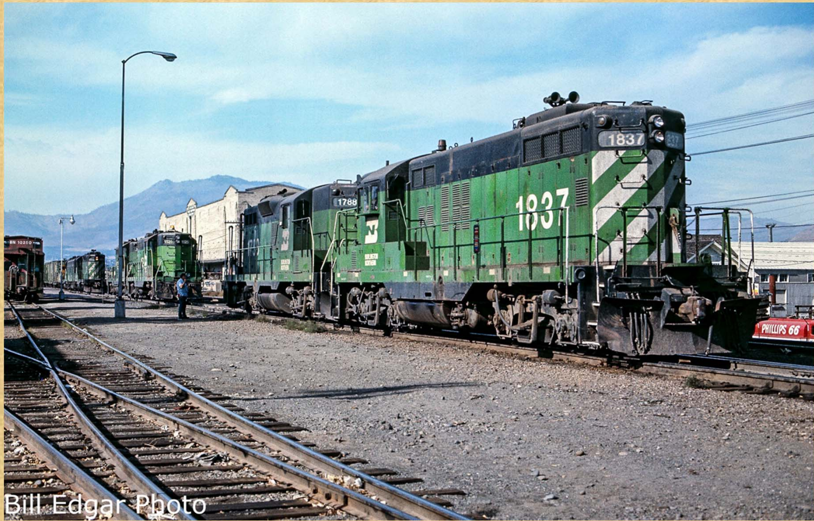
BN 1837 GP9; WENATCHEE, WA RUSH HOUR, HELPERS ON WB FET, TWO SETS OF LOCAL POWER, OROVILLE LINE AND PROBABLY WINTON LOCAL. 10/75