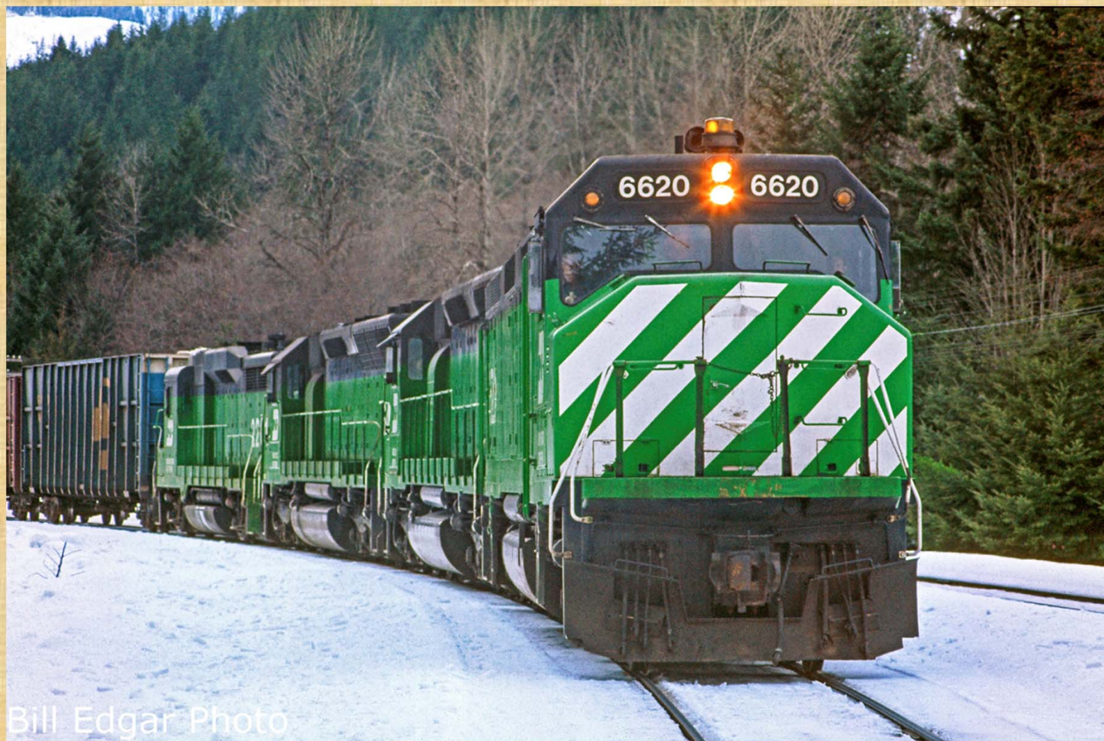
BN 6620 F45 HEADS UP AN EB FREIGHT AT SKYKOMISH W/2 SD45S AND A GP30; 022275.