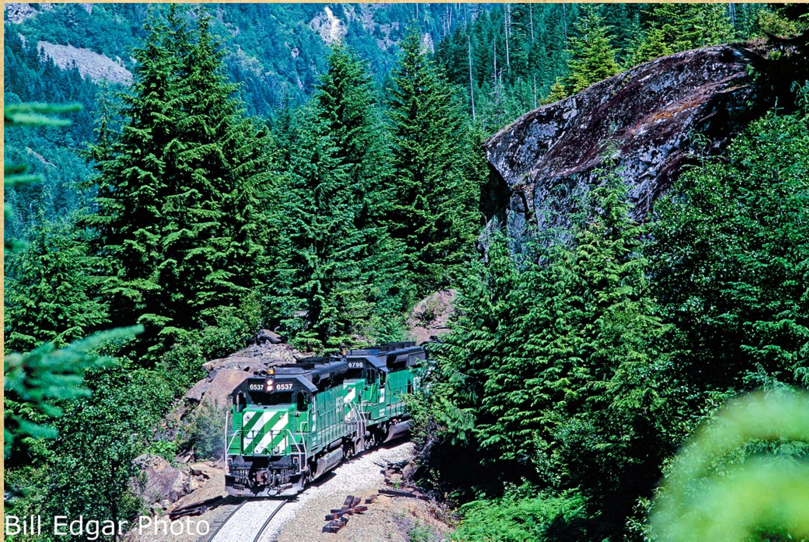
BN 6537, SD45 HEADS UP TRAIN 3 AS IT BENDS AROUND THE CURVE THRU ROCK CUTS JUST WEST OF DECEPTION CREEK, NEAR SCENIC, WA, JULY 9, 1984.