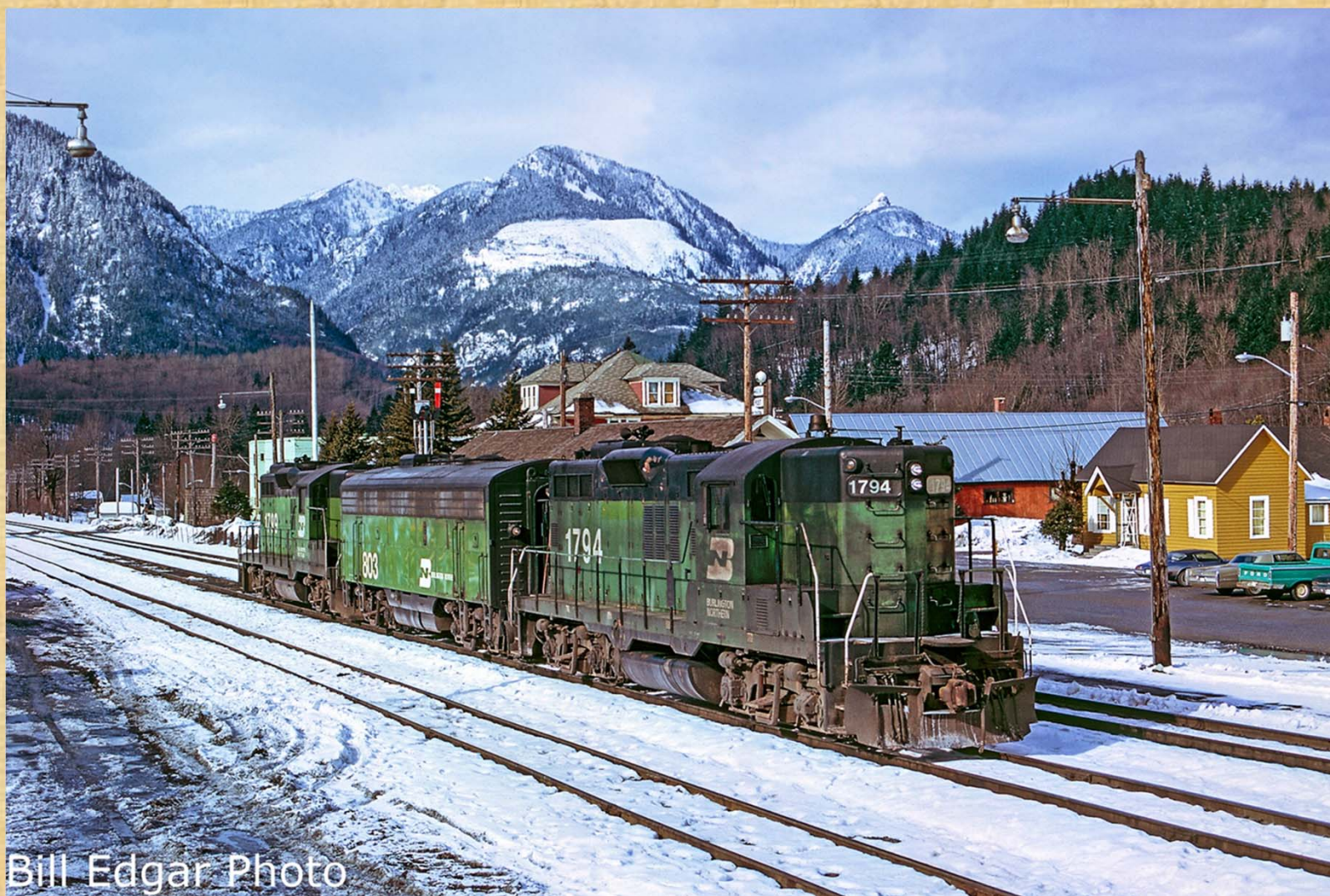
BN 1794 GP9;BN 803 F9B & BN 1799 LATE PHASE GP9 ARE A HELPER SET AT SKYKOMISH, FEB. 22, 1975, WAITING TO SHOVE AN EASTBOUND OVER THE HILL.