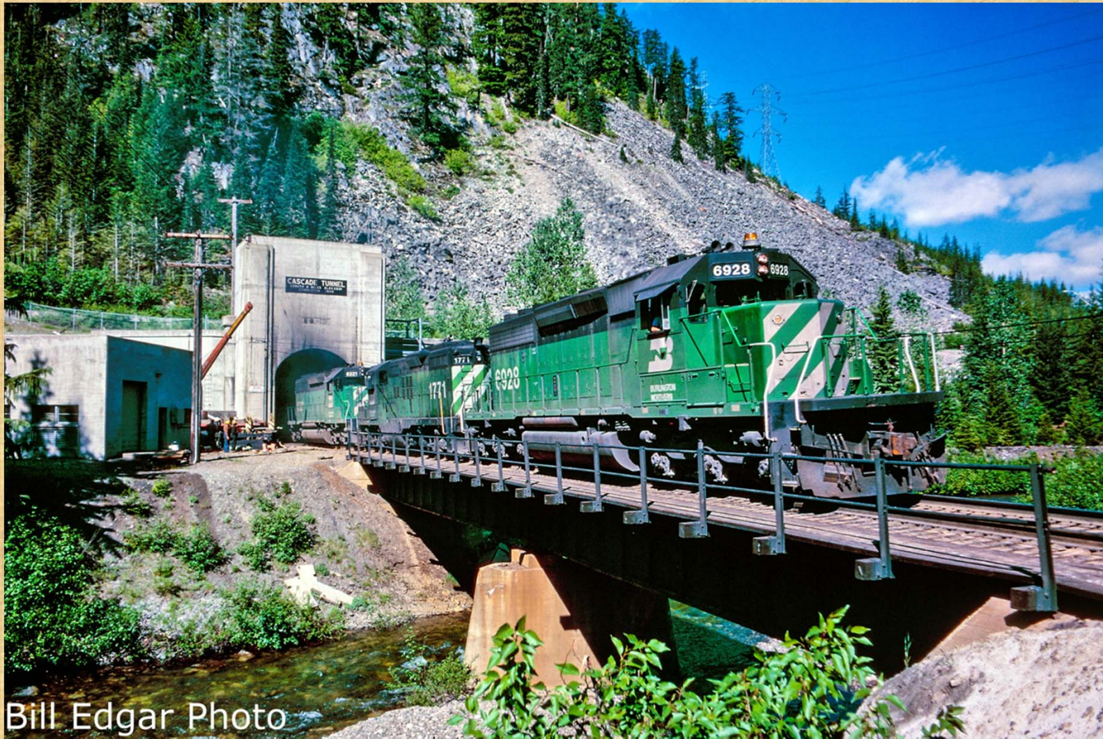
BN 6928 EXITS THE CASCADE TUNNEL AT BERNE, WA WITH AN EB INTERMODAL TRAIN, JUNE 1976.