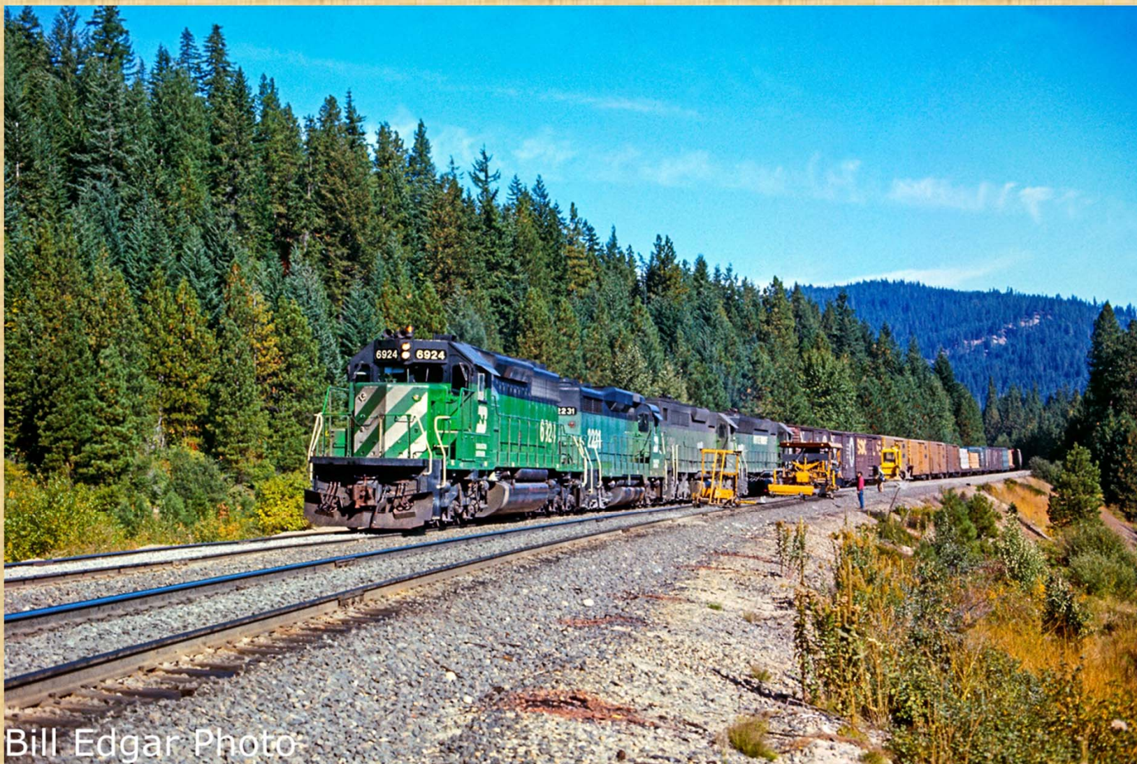
BN SD40-2 6924 LEADS GP30 2231 (X-CBQ 954), SDP40 6398 (X-GN 324), AND SD45 6430 (X-GN 400 HUSTLE MUSCLE) ON EB FRT, WINTON, WA 10/75 ON SIDING AS MOW CREWS GROOM THE MAIN TRACK.