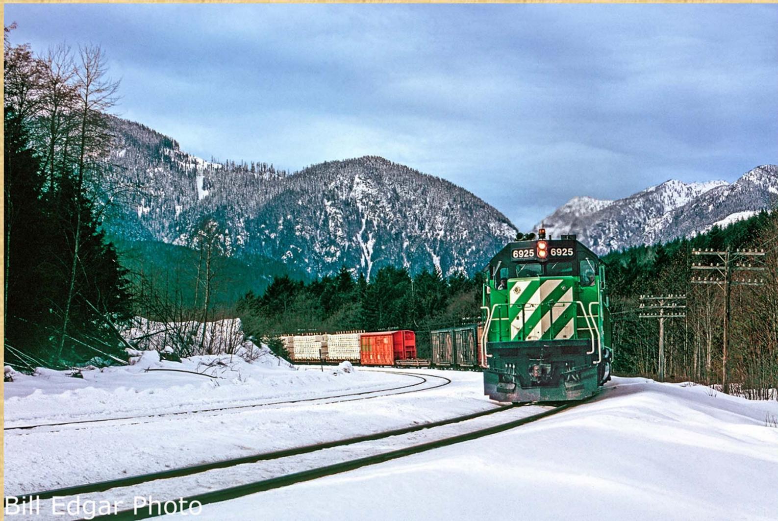
BN 6925, SD40-2 STOPS AT SKYKOMISH, WA W/EB FREIGHT TO ADD HELPERS, FEB. 22, 1975.