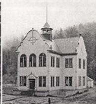
Left: Bonnie Hollingsworth's "O" scale model of the 1902 Skykomish School rendered in exquisite detail. Above: a photo of the original school shortly after it was built in 1902. Bonnie will be displaying her model at the Old Timers' Picnic 16 July before donating it to SHS Museum.